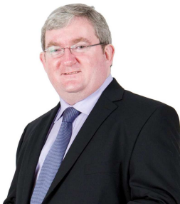
Angus MacDonald Member of the Scottish Parliament

XING: https://www.xing.com/profile/Martin_Georgi