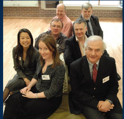
EUConsult Board Members look forward to welcoming you in Rome!